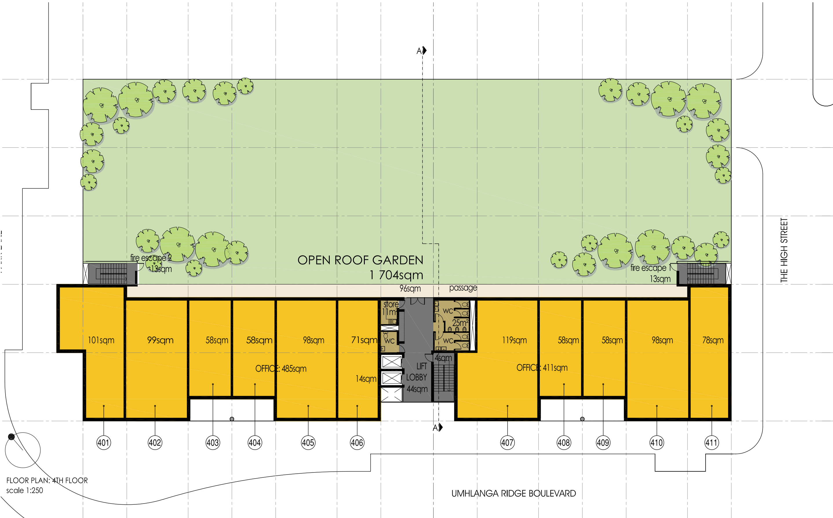
FLOOR PLAN: 4TH FLOOR scale 1:250

CLIENT THE WORX ZONE PROJECT NEW OFFICE BUILDING ON PTN 1,2,3 & 4 ERF 2532